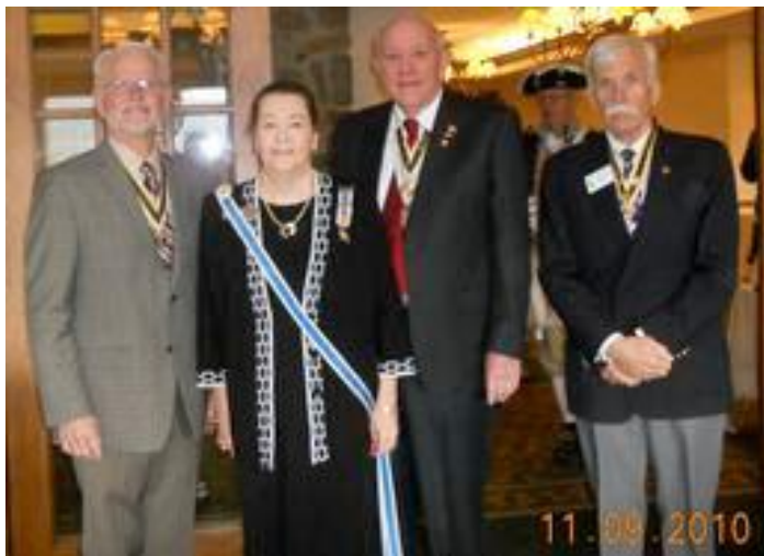
Luncheon with the DAR at the Mt. Vernon Country Club