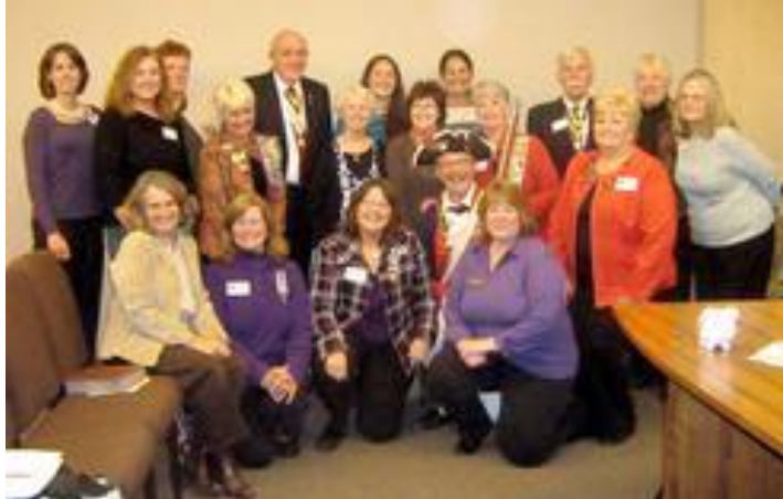
Meeting with the Piney Creek DAR in Centennial, Colorado